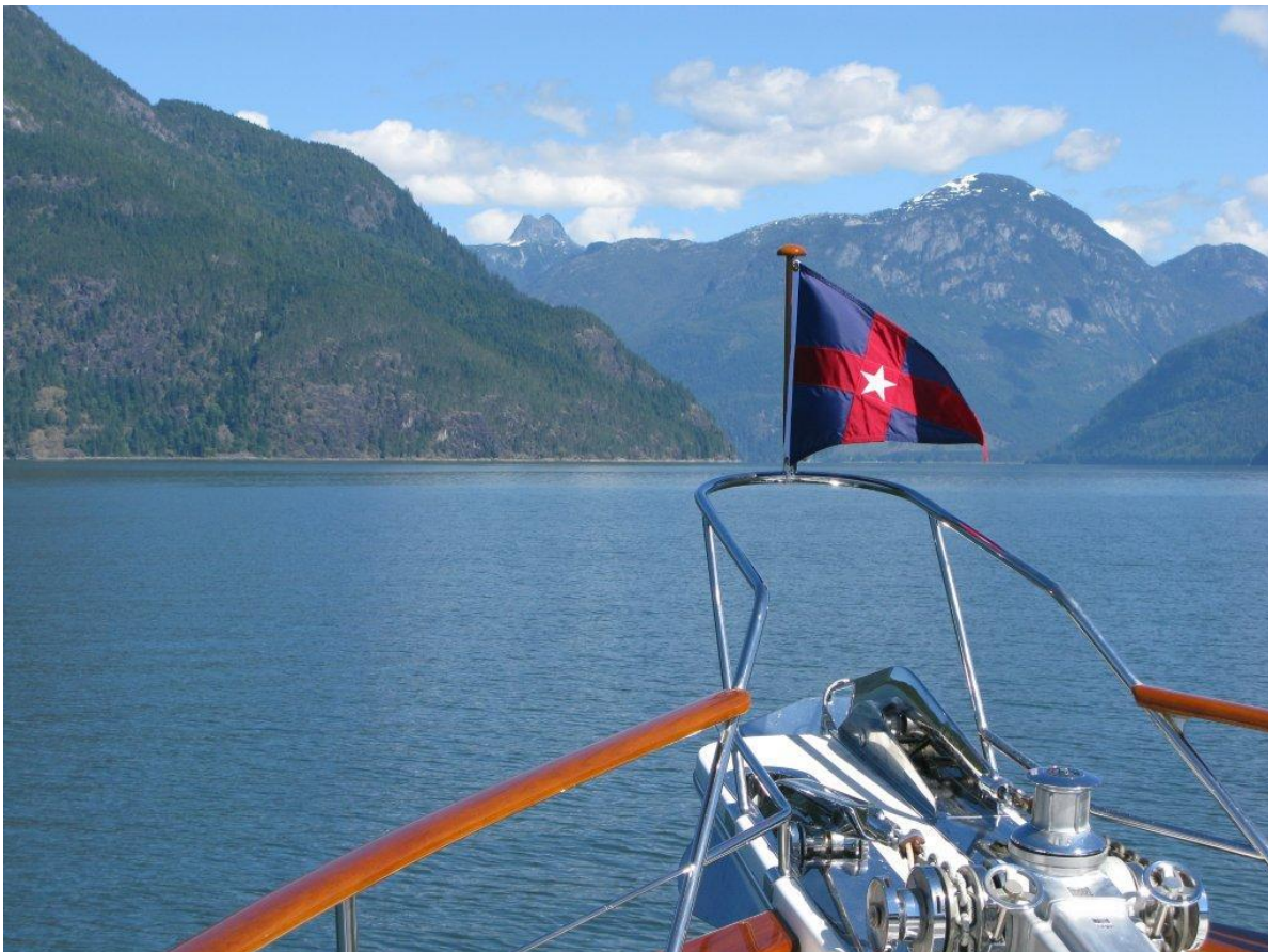
M/Y Venture Desolation Sound August 2011