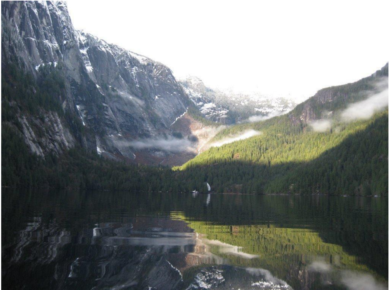
Princess Louisa Inlet