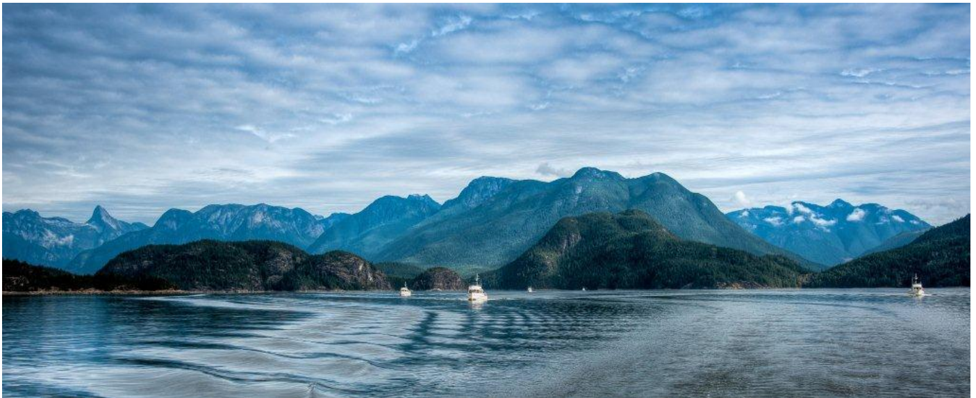
Underway for Grace Harbour

It is important that members seriously interested in this cruise move without delay to secure the boat of your choice and the length of charter you wish. Each company offers specific refund terms if your plans do not solidify, so there is no reason not to move as soon as you have reviewed this information packet. Furthermore, please note that most of the companies listed below offer discounts for groups over certain sizes, so be sure to mention that you are part of a NYYC group when you book.